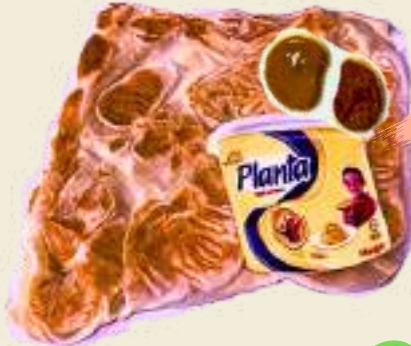
PLANTA ROTI (BUTTER)