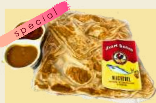
SARDINE ROTI Mackerel + Onion + Egg