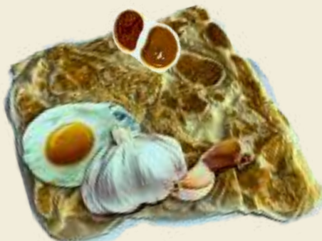
GARLIC + EGG ROTI

serves with chicken curry sauce + lentil